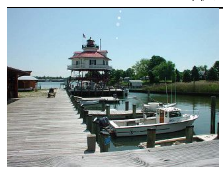
Drum Point Light House at the Calvert Marine Museum.